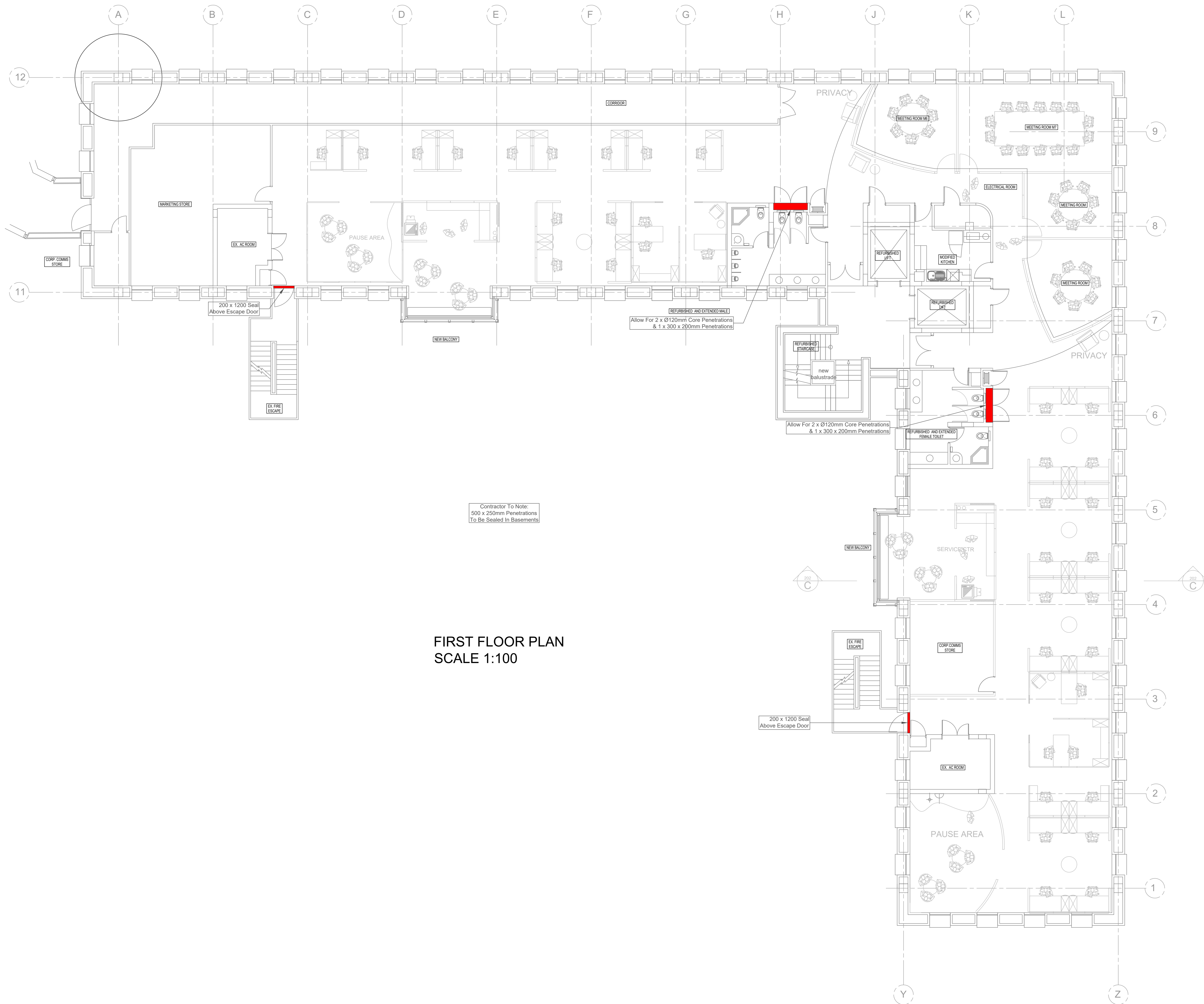
FIRST FLOOR PLAN SCALE 1:100

Contractor To Note: 500 x 250mm Penetrations To Be Sealed In Basements